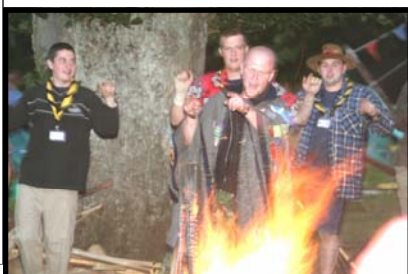
Subcamp fires burn brightly

heard echoing over the hills. The final activity of the evening took place on the hillside overlooking the camp. As the scouts looked upwards with anticipation a strange glow appeared on the hillside. The glow grew brighter and brighter and the smoke made it seem very eerie. Strange figures could be seen running back and forth in the smoke. Suddenly, with a loud bang, streams of flame shot skyward. The main fireworks display had begun. The bright colours, flashing lights, and sparking rockets made the evening complete. At the end of the show, everyone slowly drifted off to their tents—tired, but looking forward to what new adventures tomorrow will bring.